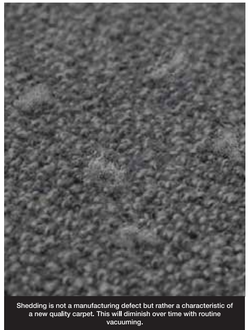
Shedding is not a manufacturing defect but rather a characteristic of a new quality carpet. This will diminish over time with routine vacuuming.

Carpets, like all other dyed textiles, will slowly lose colour over time when exposed to direct sunlight and should be protected from prolonged periods of direct sunlight. Colour change can also occur as the results of ozone, emissions from heating fuels and air conditioners, pesticides, cleaning agents, benzoyl peroxide and other household items. The occurrence, known as ozone damage, is largely unexplained, but appears to be more prevalent in coastal areas with a high ultra-violet content.